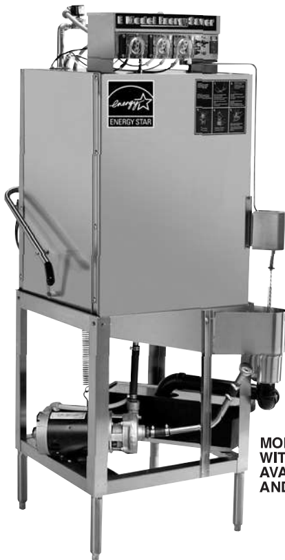
MODEL E EXT WITH 20-1/2" DOOR OPENING AVAILABLE IN STRAIGHT AND CORNER MODEL