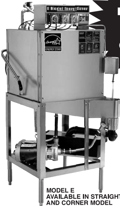
MODEL E AVAILABLE IN STRAIGHT AND CORNER MODEL

USES ONLY 1.01 Gallons Of Water Per Cycle!