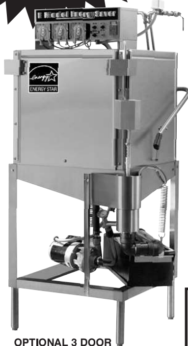
OPTIONAL 3 DOOR MODEL AVAILABLE FOR STRAIGHT AND CORNER OPERATION