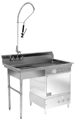
48" Undercounter dishtable with Pre-Rinse