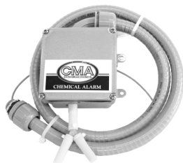
Low Chemical Alarm