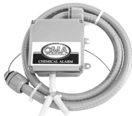
Low Chemical Alarm