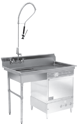
48" Undercounter dish table with Pre-Rinse