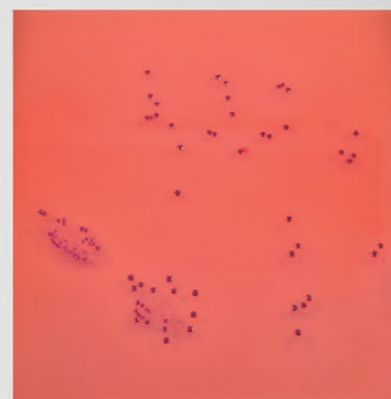
Bacteria After Washing with Dial Complete®

Dramatization only: number of organisms shown does not reflect actual number of bacteria.