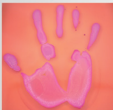
Bacteria Before Washing