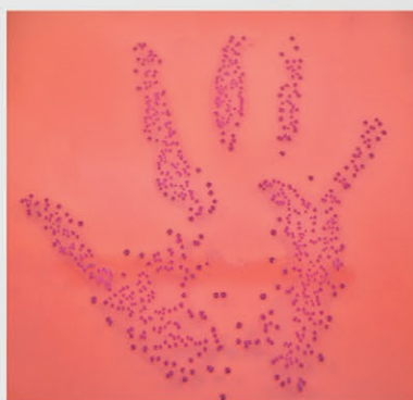
Bacteria After Washing with Plain Soap