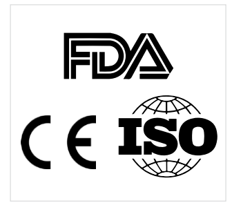
FDA, CE & ISO 13485 Certified