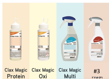
Clax Magic Protein