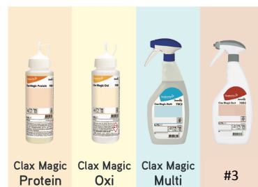
Clax Magic Protein