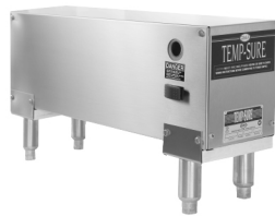
CMA Temp-Sure (Self contained 12kW heater)