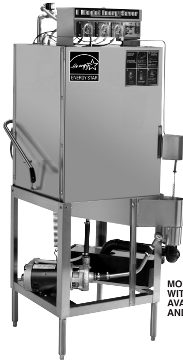
MODEL E EXT WITH 20-1/2" DOOR OPENING AVAILABLE IN STRAIGHT AND CORNER MODEL