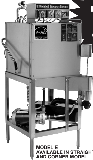
MODEL E AVAILABLE IN STRAIGHT AND CORNER MODEL

USES ONLY 1.01 Gallons Of Water Per Cycle!