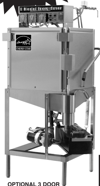
OPTIONAL 3 DOOR MODEL AVAILABLE FOR STRAIGHT AND CORNER OPERATION