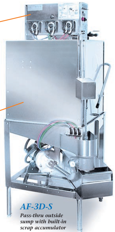
AF-3D-S Pass-thru outside sump with built-in scrap accumulator